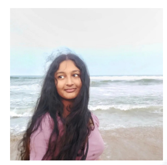
Pranavi Event Organizer